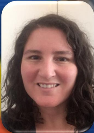
Ms. Villagio Junior/Senior Alpha A-G